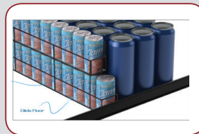
Clamato Double Stack