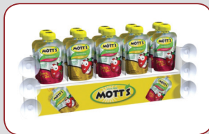
Mott's Suction Cup Rack